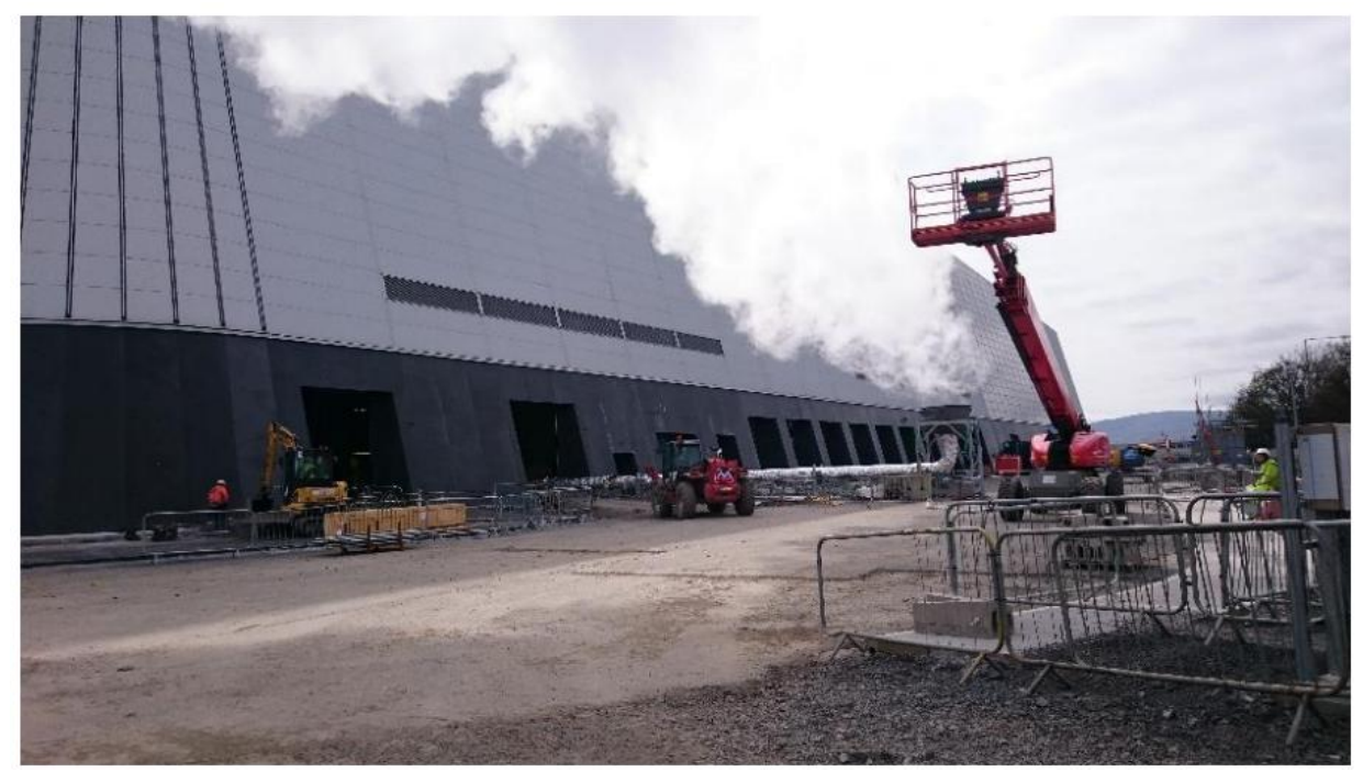
Line 1 - steam blows at the north west of the site