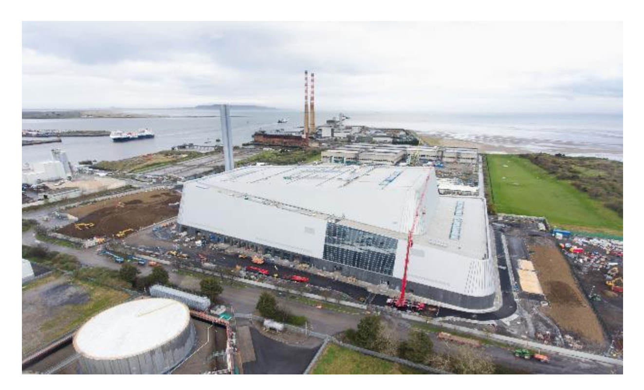
Site Aerial View Looking East March 2017 (Copyright PML).